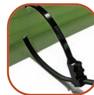
Prefitted, releasable ratchet tie/s