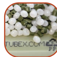
Made from environmentally acceptable polypropylene